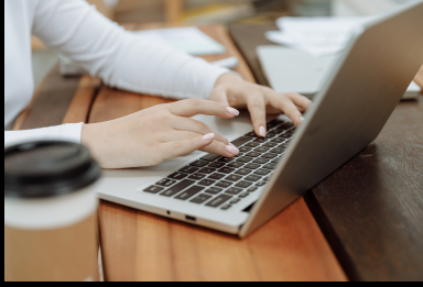
Fill Out Rehoming Form